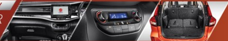
STUNNING CARBON FIBERED PATTERN DASHBOARD