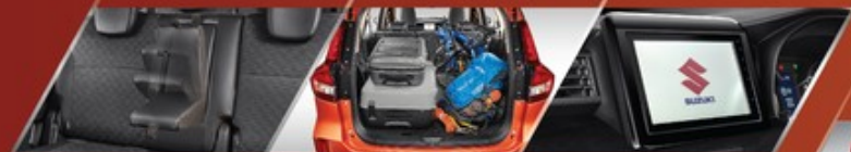
COMFORTABLE 2ND ROW CENTER ARM REST