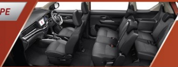
SPACIOUS CABIN WITH BLACK INTERIOR COLOR

Dilengkapi berbagai fitur-fitur extraordinary SUV yang akan membuat perjalanan semakin nyaman, aman, dan penuh gaya.